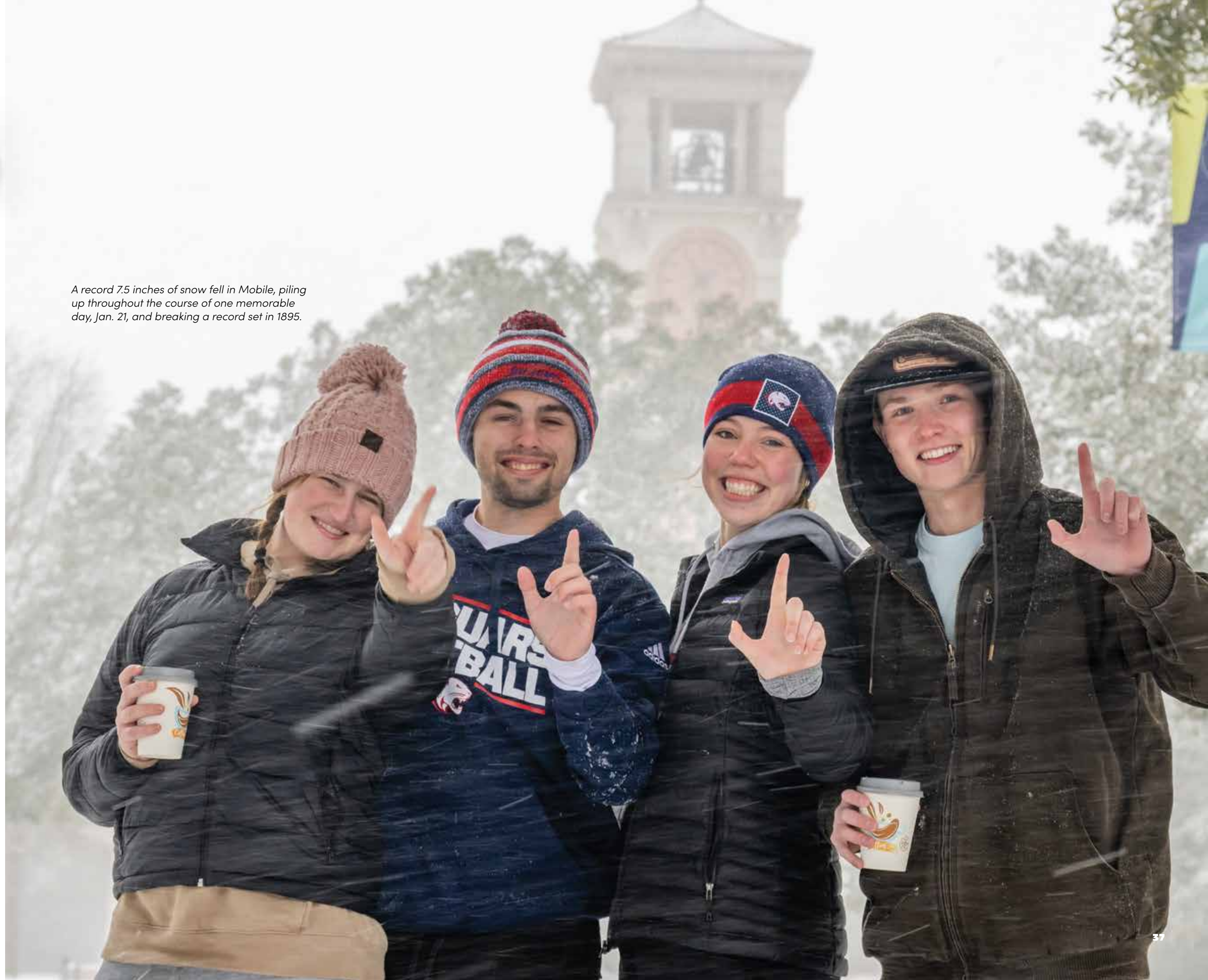
A record 7.5 inches of snow fell in Mobile, piling up throughout the course of one memorable day, Jan. 21, and breaking a record set in 1895.

Finally, THE USA WAY is being a member of Jag Nation, throwing our J's with confidence and pride for all to see. Our destiny was not predetermined. Achieving it will never be easy. But from our very first days, THE USA WAY has led us to be ambitious, determined and bold, moving onward and upward, as the Flagship of the Gulf Coast. Go Jags!